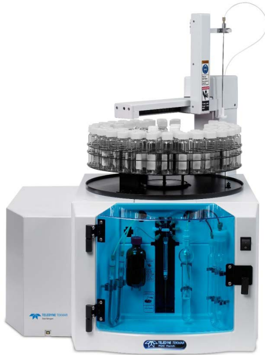
Torch TOC Combustion Analyzer with TN Module

Nitrogen monitoring is important for process control, regulations, and economic reasons. There are several techniques that can be used to monitor nitrogen, some of which can be time consuming, labor intensive, and may have waste disposal concerns. This study examines using a high temperature combustion (HTC) Total Organic Carbon (TOC)/Total Nitrogen (TN) Analyzer with chemiluminescence detection (CLD) to monitor nitrogen in samples. By using HTC TN, both TOC and TN can be determined simultaneously, analysis is completed faster, real time analysis can be done, and many matrices can be used. This study will also compare nitrogen analysis with HTC TN to other known nitrogen testing methods.